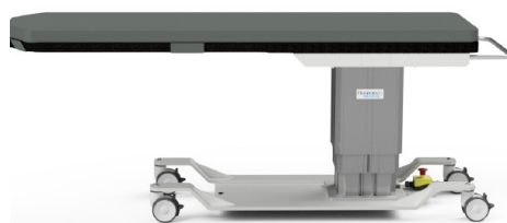
Rectangular Top Table