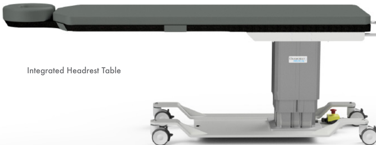
Integrated Headrest Table

Oakworks Imaging Tables have a large height range helping to create safe patient transfers while allowing doctors to stand comfortably. Our large lifting column is very rigid, ensuring rock solid support for fast imaging and procedures. Available with an integrated headrest or rectangle top.